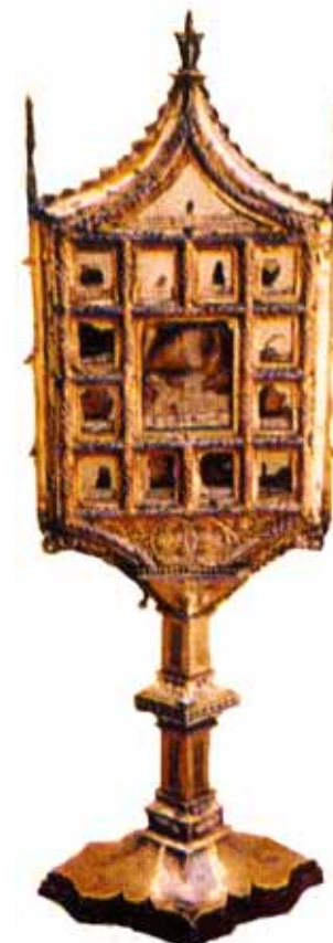
Monstrance containing the relics of the miracle