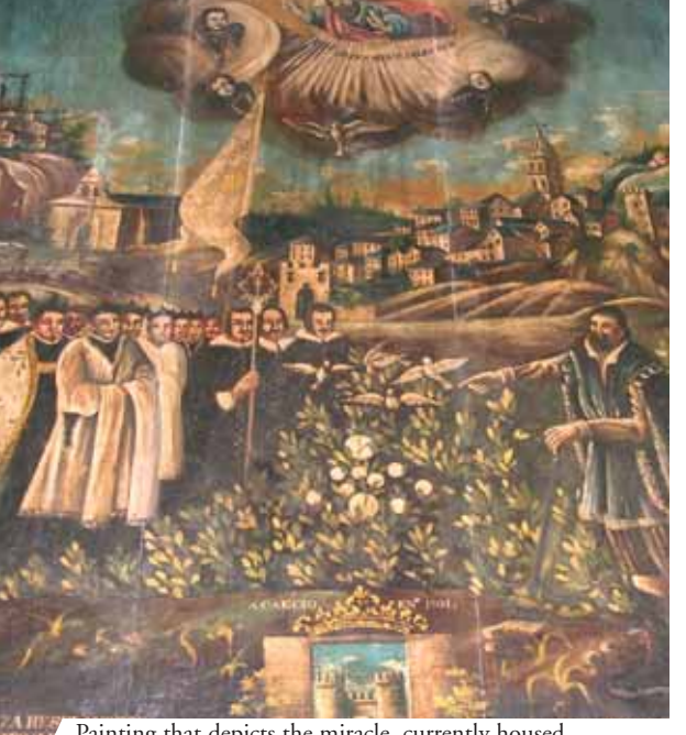
Painting that depicts the miracle, currently housed in the new church of St. Peter