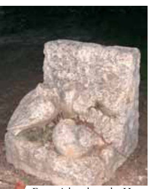
Exact sight where the Hosts where found